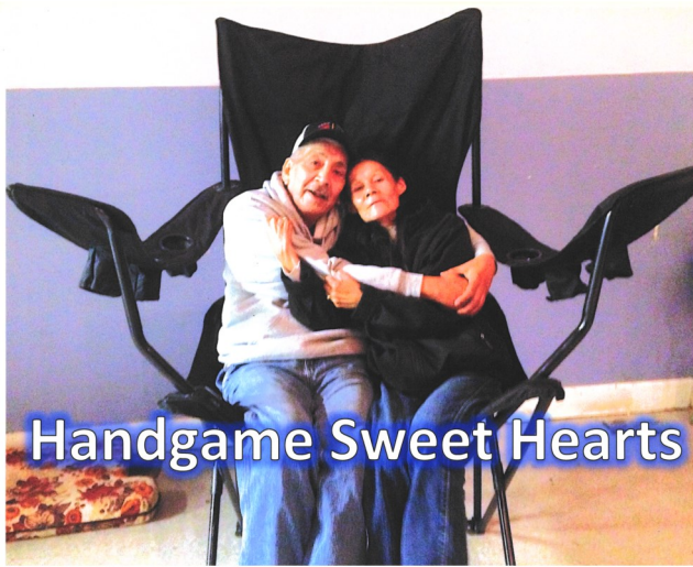
Handgame Sweet Hearts